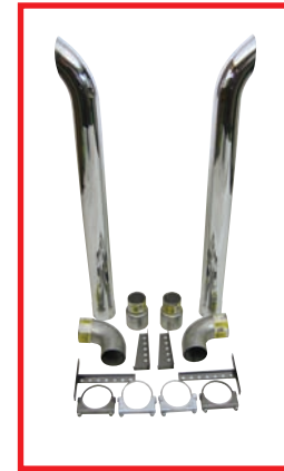
89303 & 89304 Staxx Kit