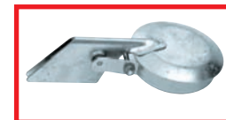
35931 4" Chrome Rain Cap