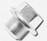
35299 Plug Used in fitting when oxygen sensor is not required