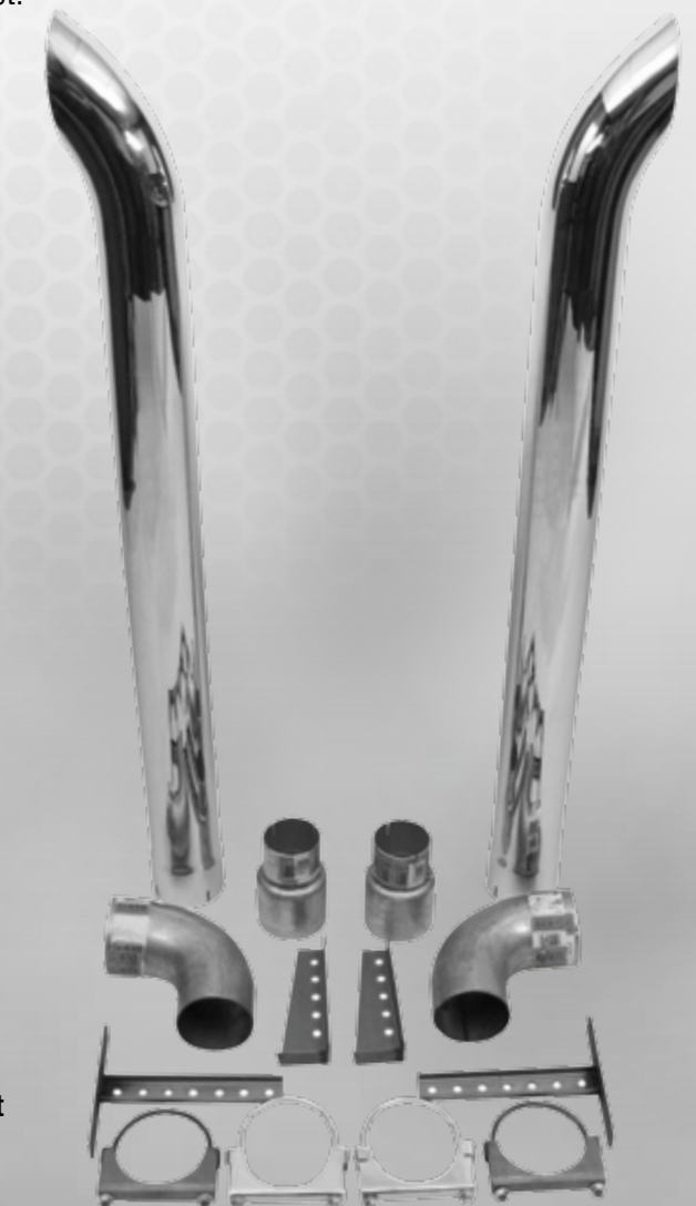
89303 Staxx Kit