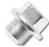
35299 Plug Used in fitting when oxygen sensor is not required