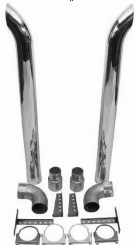
89303 Staxx Kit